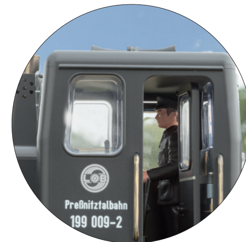
The cab has an appropriate figure